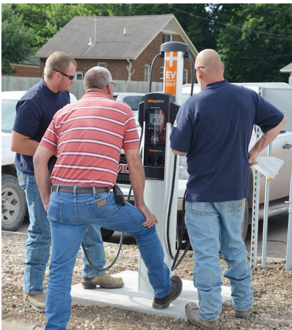
EV Charging Station

Contact the BPW 402-274-4981 if you are without power.