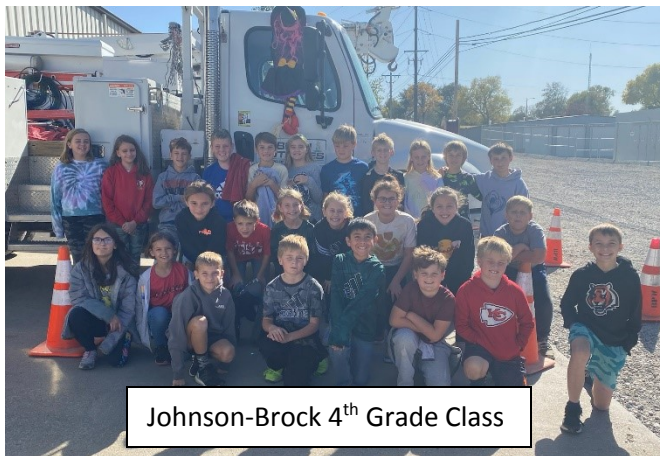
Johnson-Brock 4 th Grade Class