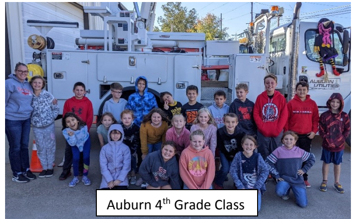
Auburn 4 th Grade Class