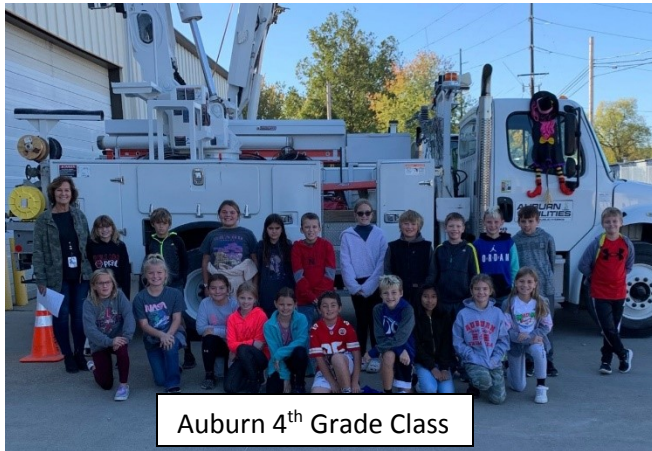
Auburn 4 th Grade Class

Auburn and Johnson-Brock students attended BPW's annual Energy Fest on October 13, 2022. Tours were given of the Water, Wastewater, and Power Plant as well as an Electrical Safety demonstration by BPW linemen. The BPW staff take great pride in displaying their facilities to our area youth, as well as extending useful knowledge into the world of utilities.